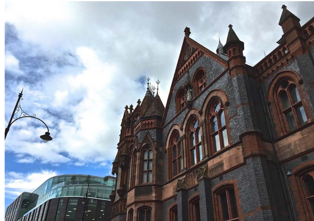
Reading Museum and Town Hall