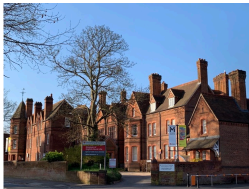
The Museum of English Rural Life

Tourist information: https://livingreading.co.uk/visit/places-to-visit-in-reading