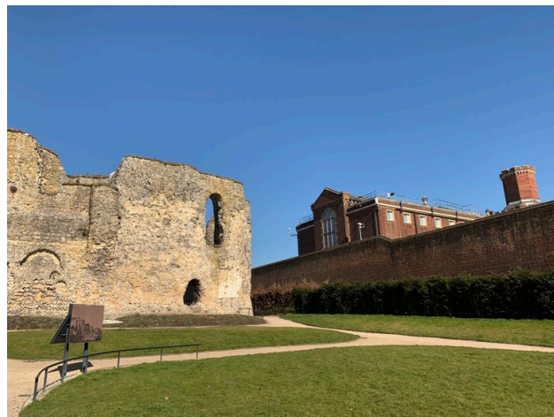
Reading Abbey ruins and Reading Gaol