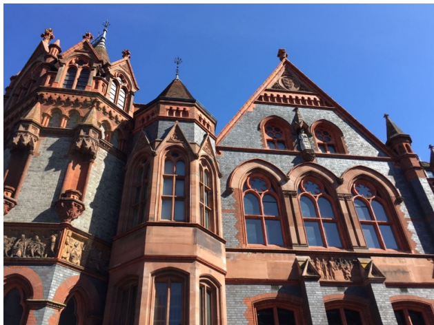
Reading Town Hall and Museum