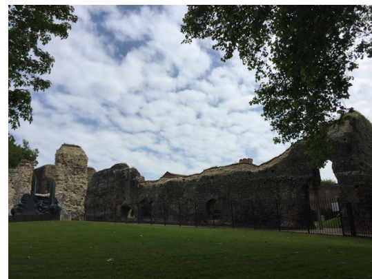
Reading Abbey ruins

The meeting point for both is at the Town Hall reception.