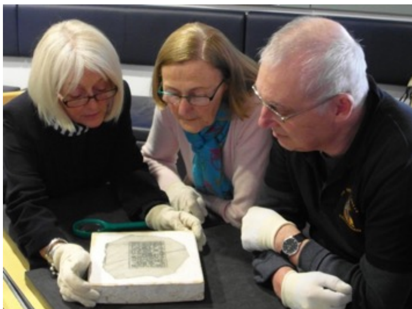
Egypt Centre Swansea

The Friends of the Egypt Centre committee would like to extend their warmest gratitude to the British Association of Friends of Museums for recognizing the impact of the efforts we have gone to in order to ensure our programme of lectures are as engaging and accessible as possible following the impact of the COVID-19 lockdown period. An ancient Egyptian Memphite formula includes a blessing hoping for ‘life, prosperity, and health’, which has proven a good exhortation for our society, as we have been told by our global community of members that the lectures do indeed provide a positive impact of their quality of life, particularly during this difficult transition out of lockdown.