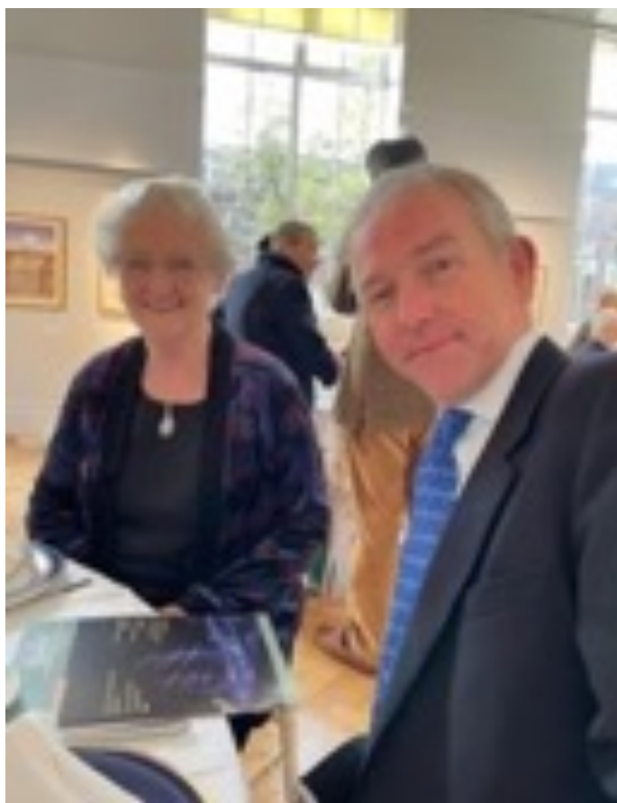
Guests enjoying the latest edition of the BAFM Journal at the Ulster Museum