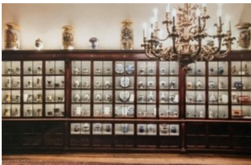
Apothecaries' Hall, London