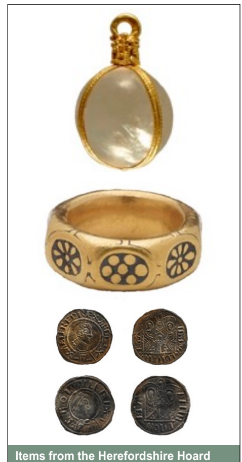
Items from the Herefordshire Hoard