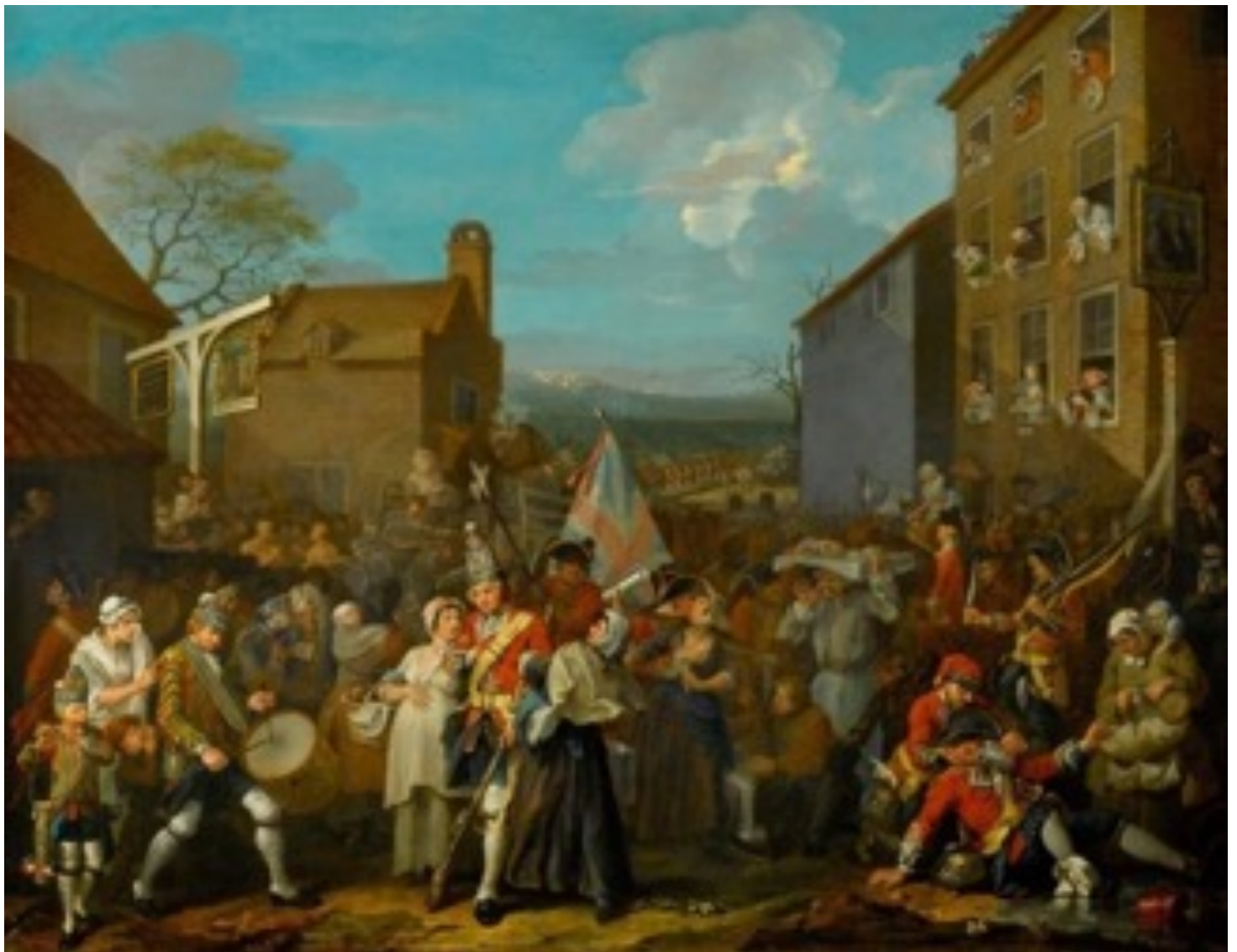
William Hogarth, The March of the Guards to Finchley, 1749-1750, oil on canvas. (Image 2005.4 with frame)