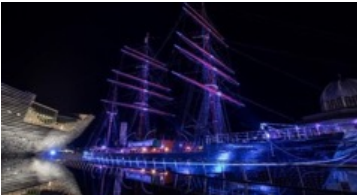
RRS Discovery, with the V&A in the background