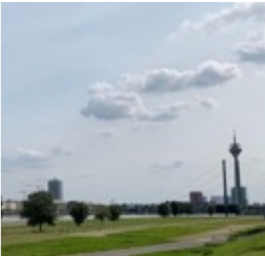
The Rhine at Dusseldorf

The Friends of Reading Museum Impact Award 2022 Runners Up