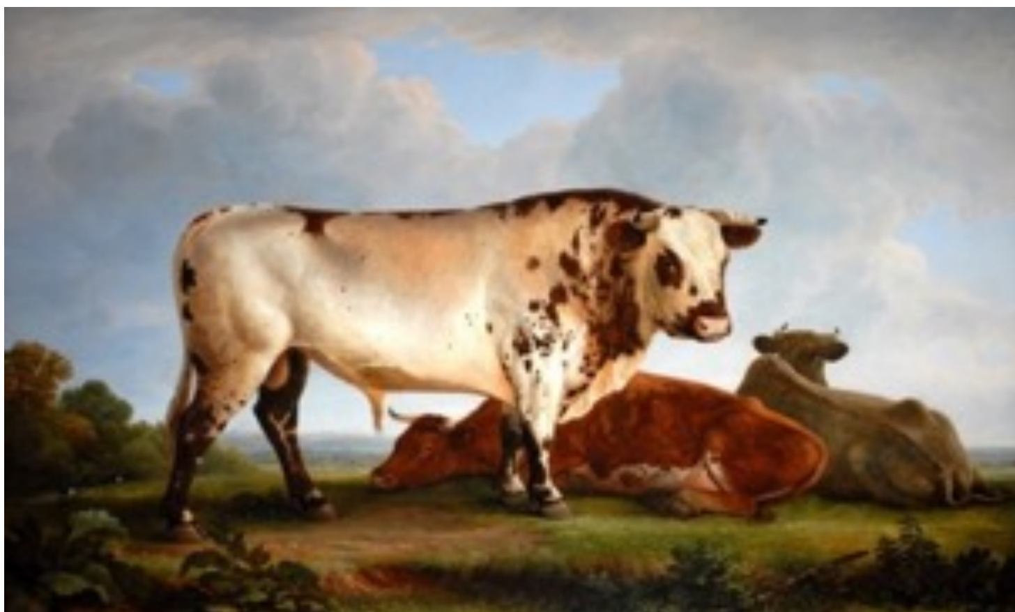
Bull by John Glover (1767 – 1849) reproduced by permission of The Bowes Museum

Bull the painting was a spectacular find on the part of John Bowes. To acquire a painting by an artist of such renown as John Glover, and at such a good price, was a stroke of genius.