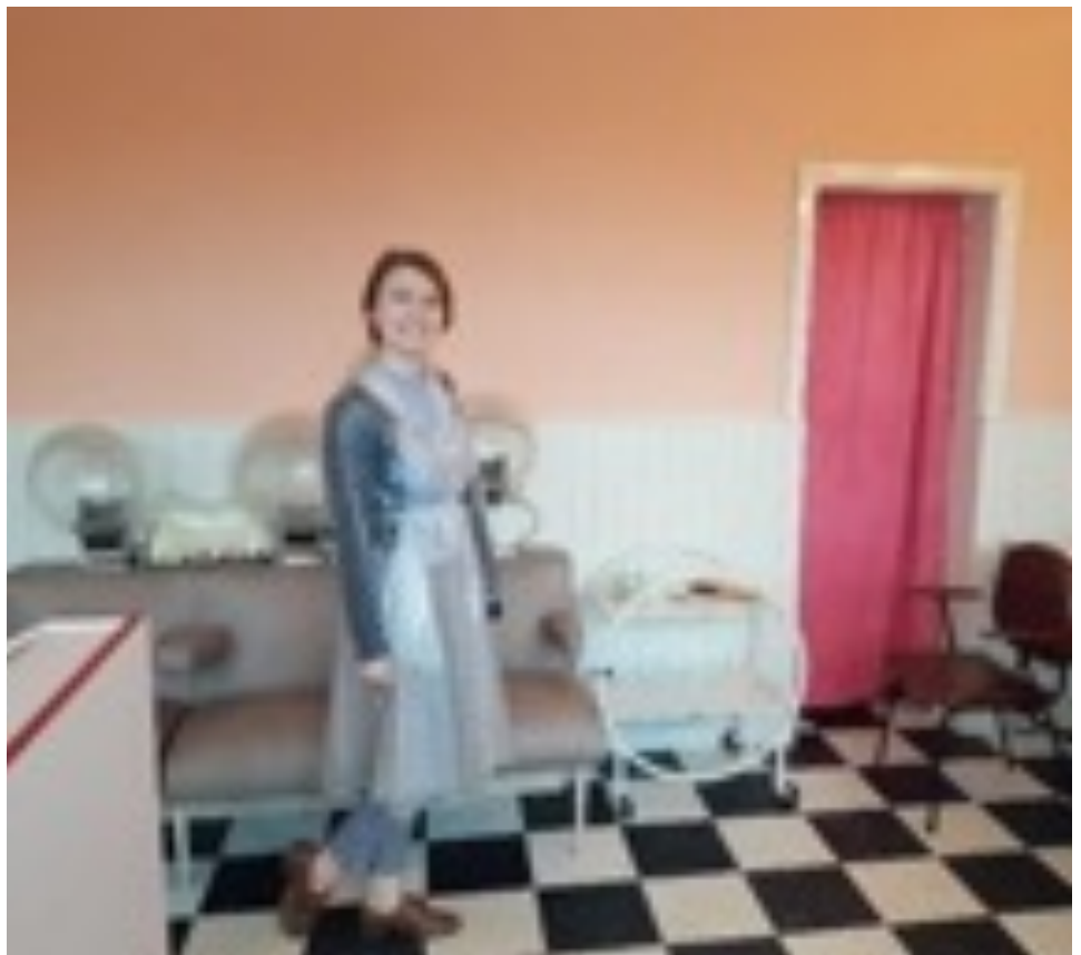
1950's Hairdresser in the Beamish Museum

The Friends of Beamish has committed to support the Re-Making Beamish project, the largest single expansion in the museum's history. This support comes in two forms – financial input from Friends and Business Friends and by the work of volunteers restoring and creating items for the new attractions. Our volunteers have been busy in the workshops restoring beds, cupboards, dressers, miniature golf obstacles and a harmonium for the new developments. We have also produced faithfully accurate recreations of 1950s waste bins and benches based on stills from a 16mm film in the Beamish archives. We are restoring a 1931 bus for the RB Project and maintain three Model T Fords bought by the Friends for Beamish. In May 2021 we were able to present Beamish with £150,000 and a further £200,000 in February 2022. These totals do not include project expenses or the 3530 volunteer hours related to our restoration activities! Highly Commended